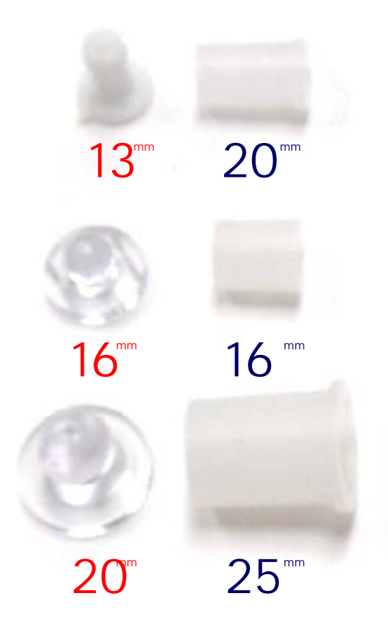
Red= fixing diameter Blue= standoff distance

Fixing screws and rawlplugs are not supplied unless specifically requested.