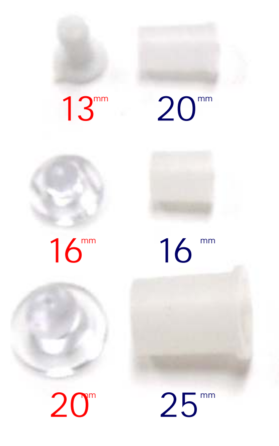
Red= fixing diameter Blue= standoff distance

Fixing screws and rawlplugs are not supplied unless specifically requested.